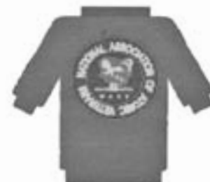
N 16 J N.A.A.V. JACKET $ 40.00