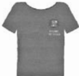
N 15 T T - SHIRT $ 14.00