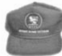
N 8 C N.A.A.V. CAP $ 14.00