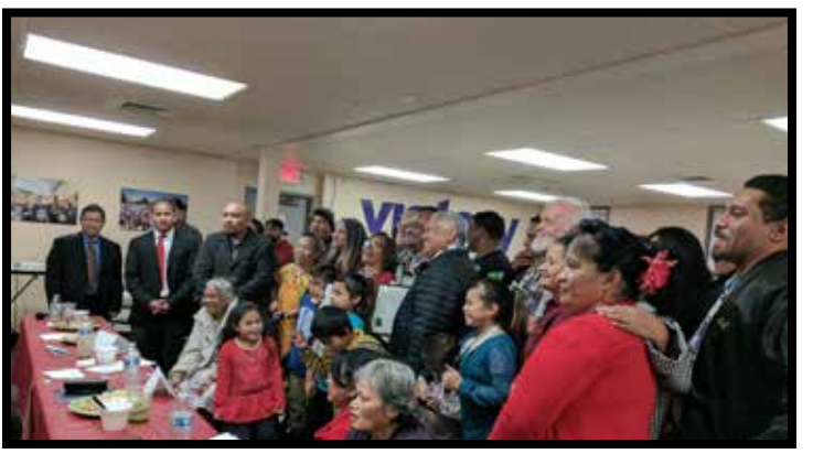
(Continued on Page 6)