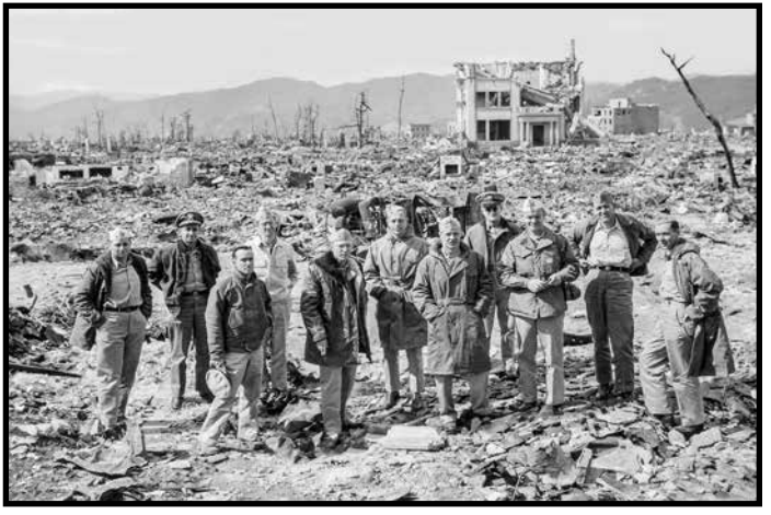
Officers of the USS Appalacian AGC-1 pose for a photo in the rubble of Hiroshima, Japan, after the first atomic bomb instantaneously destroyed the city.

Other photos show officiers from the appalachian posing in front of the rubble of Hiroshima and Nagasaki.