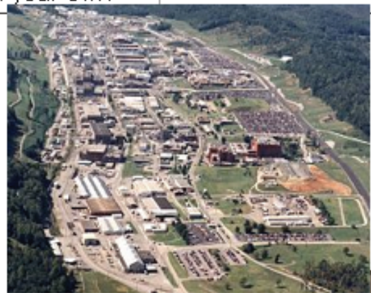
Y-12 Plant, in Oak Ridge TN.