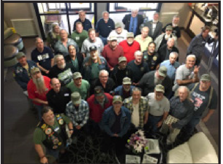
Remembrance Day CleanUp Veterans