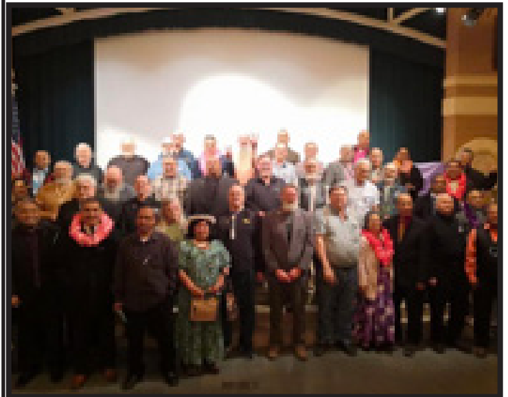
Joint Marshallese Enewetak CleanUp Personnel March 1st 2020