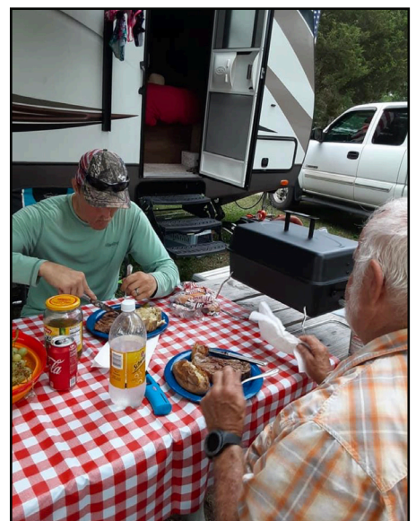
FATHER'S DAY WITH FRIENDS