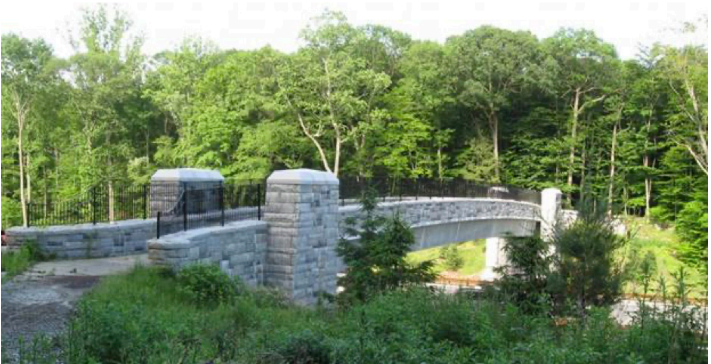
TACONIC STATE PARKWAY BRIDGE