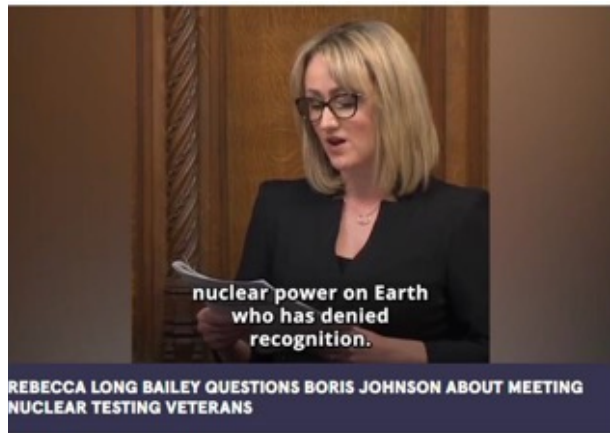
IMAGE IN HOUSE OF COMMONS