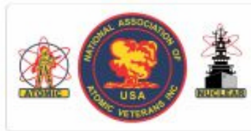
License Plate $25.00