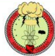
Guinea Pig Lapel Pin - $10.00 Embroidered Patch $15.00