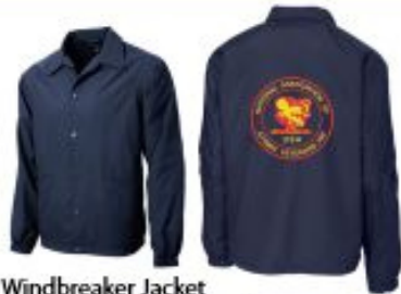
Windbreaker Jacket NAAV logo embroidered M-XXXL - $65.00 Add $5 for XXL-XXXL