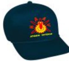
Embroidered Cap - $20.00 CAP - NAAV LIVE MEMBER $30.00