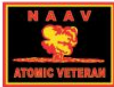
Auto Decal 4" x 6" $10.00 2" x 4" $6.00 2" x 3" $5.00