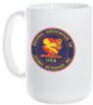
15oz Ceramic Mug $25.00