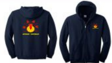
Zip Front Hooded Sweatshirt- NAAV M-XXXL - $45.00 (Add $3 for XXL-XXXL) Army Green, Navy Blue, Marine Red, USAF - Blue