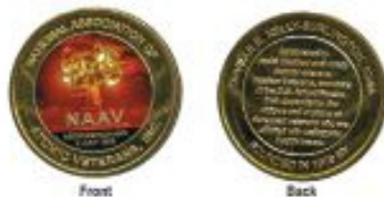
Challenge Coin $25.00