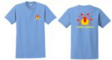
Printed Tees - NAAV M-XXXL - $28.00 (Add $3 for XXL-XXXL) Long or Short Sleeve Army Green, Navy Blue, Marine Red, USAF - Blue