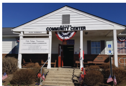
Oak Ridge History Museum