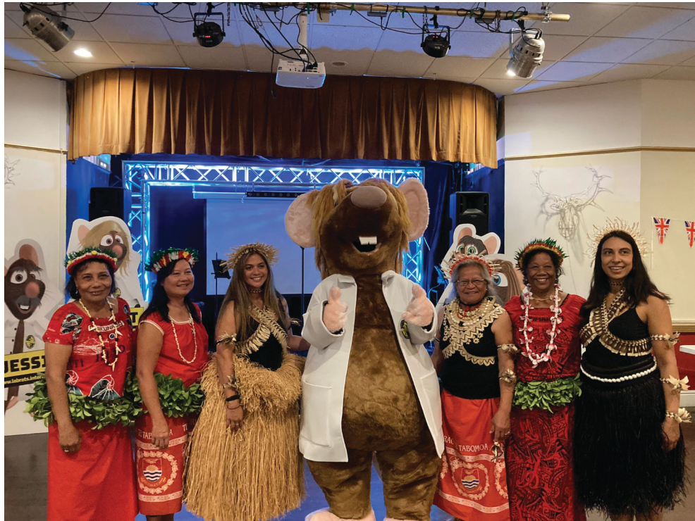
KTA Dancers with our mascot Kitty at the All Tests Reunion 2022

Our annual re-union took place from 19 th –23 rd September at Pontins, Sand Bay and a great time was had by everyone who attended. Dancers from the Kiribati Tungari Association were present at the event and performed traditional dances.